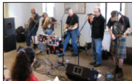
Threatening skies cleared just in time for the October 3rd Highland Concert. The Carriage House was packed with young and old alike swaying to the sounds of Na'Bodach's Celtic music.

www.williamtrenthouse.org for the latest information about upcoming events